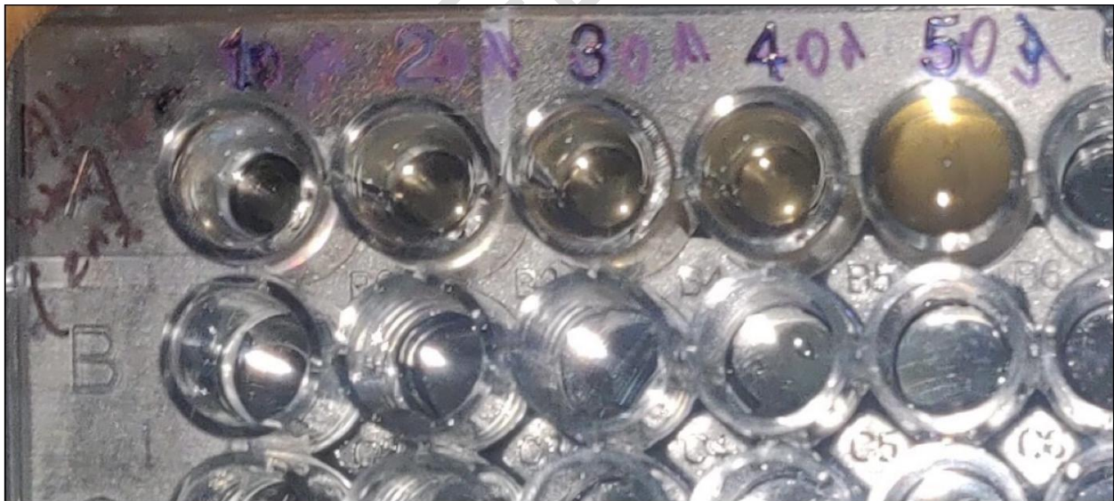
Figure 3: Evaluation of antioxidant activity