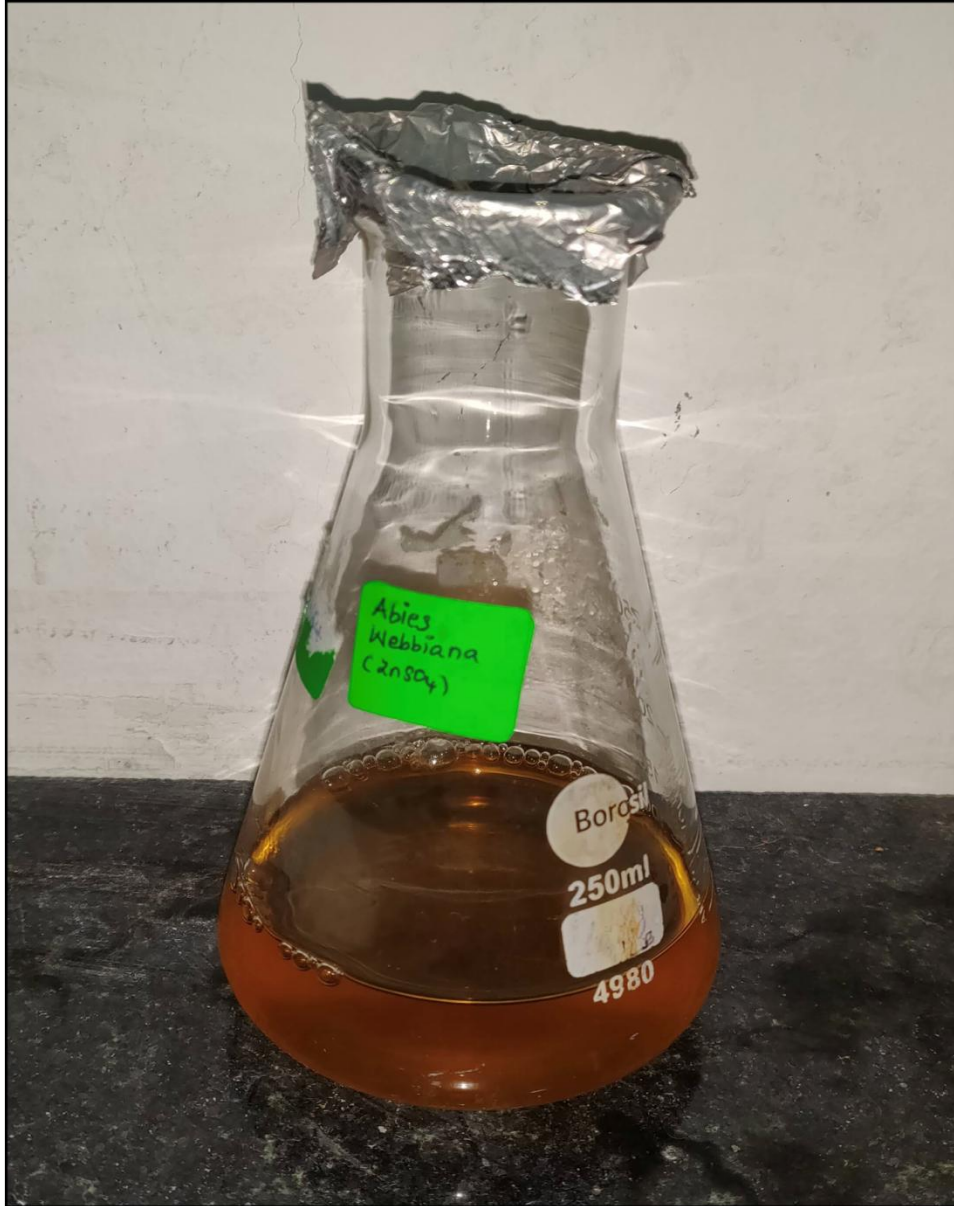
Figure 1: Visual observation of colour change