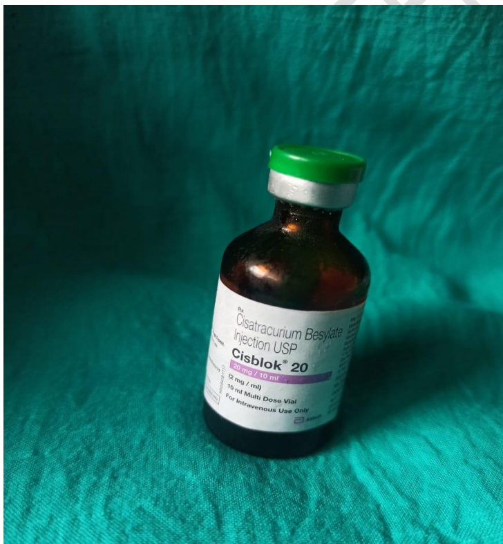
Figure 2: Vial of Cisatracurium