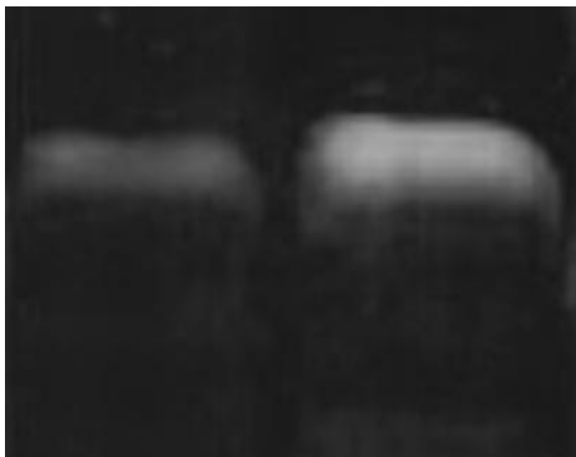
Fig: 2 Agarose gel image of isolated DNA from white edible part of Cocos nucifera and Borassus flabellifer using phenol-chloroform method of extraction.