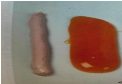
Fig 1. Dispense on glass slab

The inclusion of accelerators, such as zinc acetate, increases the operating duration of the dressing. Dressings containing zinc oxide and eugenol come in two varieties: liquid and powder, which must be mixed together before using it. Eugenol in this pack may produce an sensitivity reaction in some persons, causing skin reddening and burning irritation.