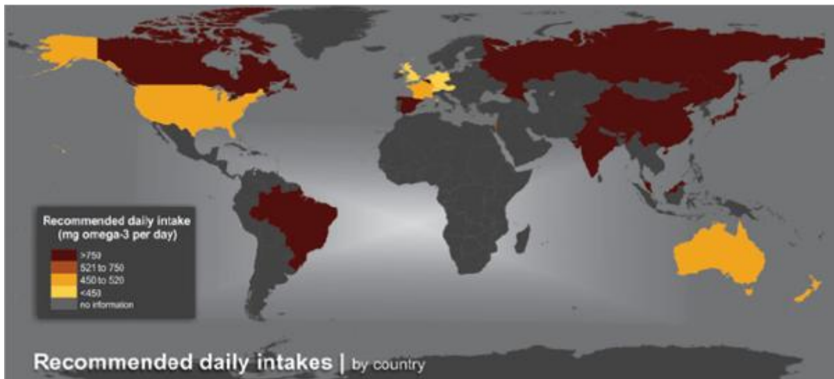
Figure 1: Recommendation of Longer chain n-3 (EPA + DHA) everyday consumptions by nation