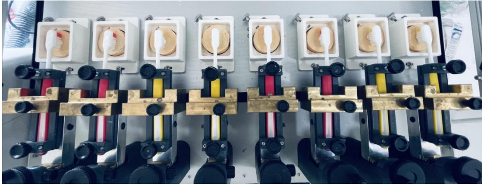
Figure 2: Image showing the subjecting of the two brands of GIC to standard and herbal toothpastes in a brushing simulator.