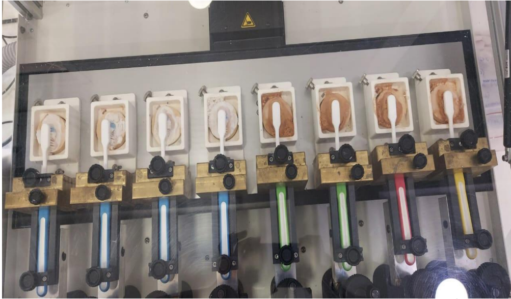
Figure 2: The image shows the samples placed in the brushing simulator.