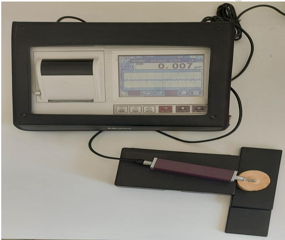
Figure 3 : Represents the stylus profilometer used to obtain the values of surface roughness.