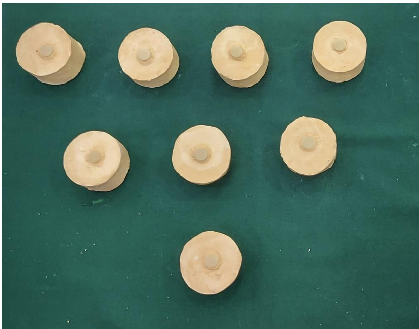
Figure 1: The image shows the 8 samples prepared using Centon N restorative material.

The surface roughness value prior and after performing brushing simulation were obtained and the values were tabulated, with the tabulated values descriptive analysis “Paired t test” was performed using the statistical software “SPSS version 23” and the result of the analysis carried out was depicted in the form of bar graphs.