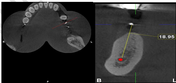
Figure2. CBCT radiography and measurement of specified points