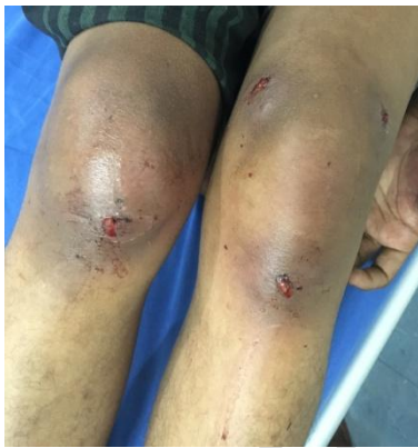
Figure 1 Abscess over bilateral knee joint