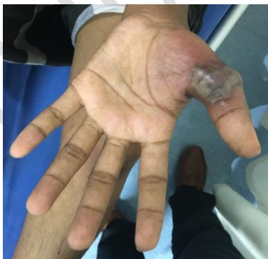
Figure 2 Abscess over Left Hand