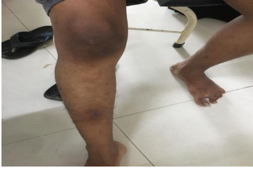
Figure 6 Resolution of abscess in leg