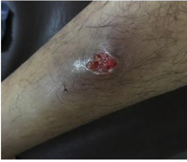
Figure 3 Abscess over Right Leg