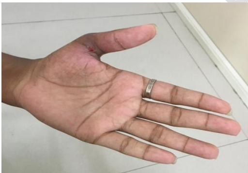
Figure 5 Resolution of abscess in hand