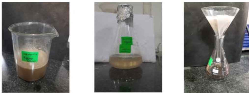
FIGURE 1: Preparation of Boerhaavia diffusa extract mediated zinc oxide nanoparticles and the solution of boerhaavia diffusa in zinc sulphate solution.