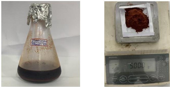
Figure 1:Preparation of ethanolic extract Pterocarpus santalinus .