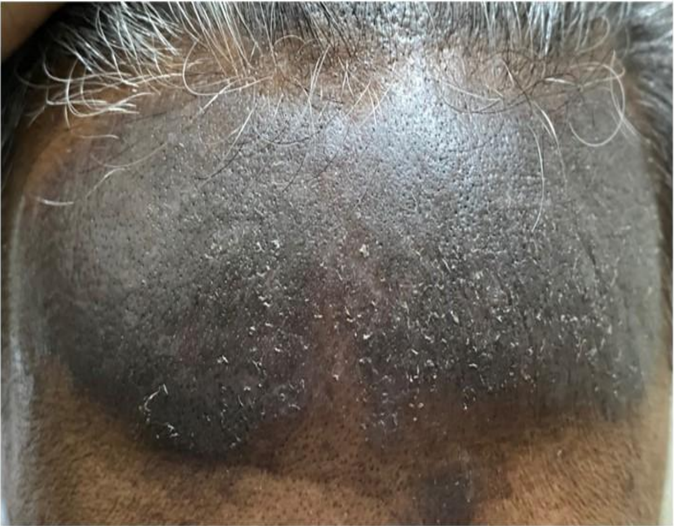
FIGURE 1 : Hyperpigmented diffuse plaque over forehead