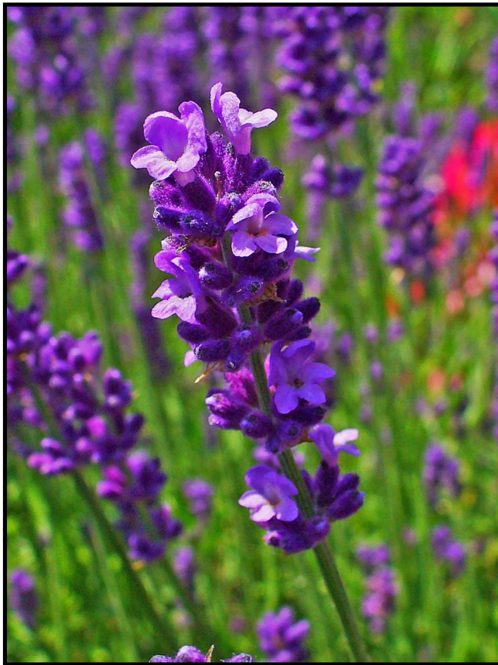
Fig. 1. Plant morphology

flowers and have various bioactive compounds of economic importance.