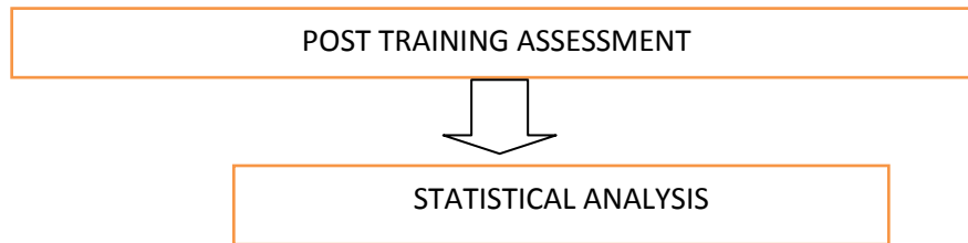
Fig1: Flowchart of the study design