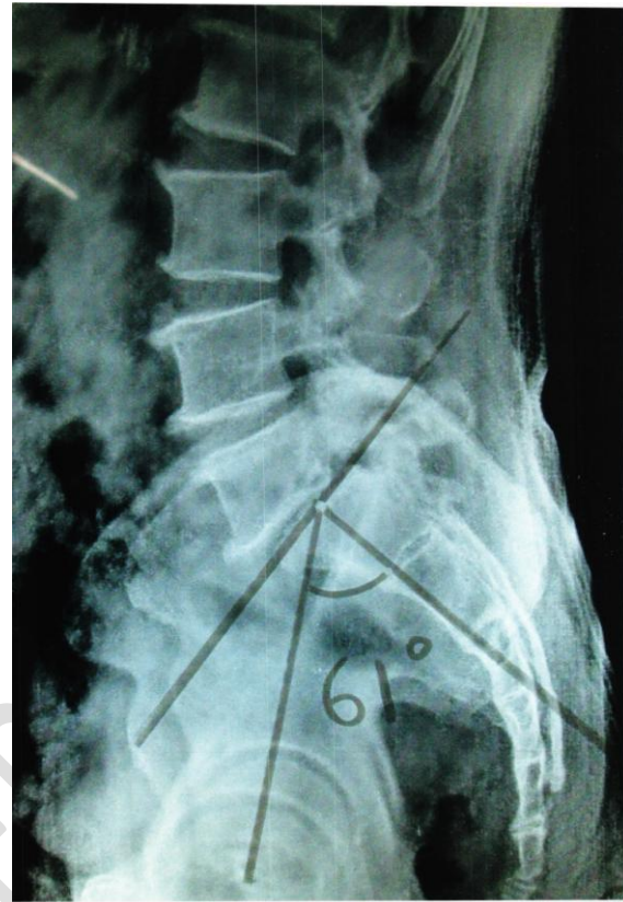
Mrs.E,50 yrs old Male, PIA-61°

Conclusion: In the study group the lowest pelvic incidence recorded was 42° and the maximum recorded was 75° with an average of 58.34°. In the low grade spondylolisthesis group the average pelvic incidence was 57.78° and in the high grade spondylolisthesis group it was 64.75°. Pelvic incidence is an important anatomical parameter in regulating the sagittal curvature of spine.