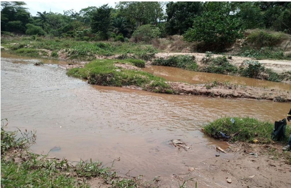
Fig. 6: Ekulu River in a less active area (below Abakpa Bridge). Nylon, plastic containers and wood debris were deposited as part of sediments on the present channels and bars of the river

Braiding and meandering channels are also present within a stretch of length in this locality. Vegetables were planted on the ancient terraces of the river. Nylon particles, plastic containers and woody debris were found deposited as part of sediments on the present river channels (Fig. 6).