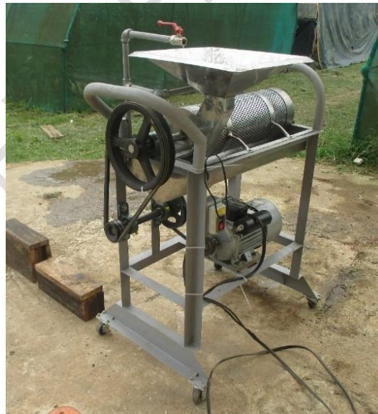
Figure 4. Fabricated demucilaging machine

The fabricated demucilaging device's design is a continuous type machine (Figure 4) with an overall dimension of 918.2 mm x 622.4 mm x 1,113.2 mm. It has six major parts: hopper, demucilaging cylinder, water supply system, output chute, frame, and power transmission system. The device removes the mucilage adhering to newly depulped parchment coffee by