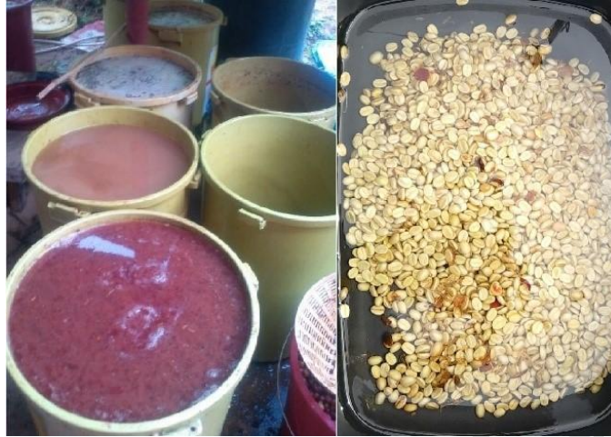
Figure 3. Conventional removal of mucilage

demucilager machine in the market, three cooperatives and six individual growers surveyed wanted to avail if they could afford it.