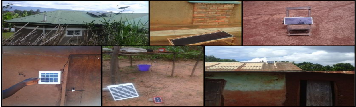
Figure 3 Different modular capacities: [42]