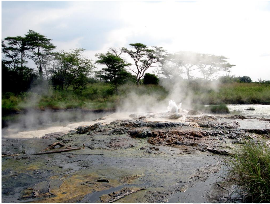
Fig.2; Illustration of a geothermal hot spring at Sempaya

In 2014, the geothermal resources department was created in MEMD with a budget of Uganda Shillings 100 Million (U.S $30000) for core staff and Geothermal energy Development project had a budget of Uganda Shillings 5.1 billion (U.S $1.2 Million) (MOFPED). The sub surface temperature levels range between 150°C to 200°C. A model by Government and federal Institute of Geosciences and natural resources Germany has been developed for possible geothermal power development with 30MW for the start and 150 MW in the medium term. Preliminary viability and feasibility studies involving drilling of deep exploration wells that will help provide information on the reservoir temperature, fluid chemistry and other petro physical parameters are being done. Geothermal power is costed at U.S$ 0.077 per kWh which is cheaper than most renewable energy resources like hydro and solar (ERA 2020). Installing 150MW of geothermal power would allocate electricity to 3,000,000 people in rural areas of western Uganda.