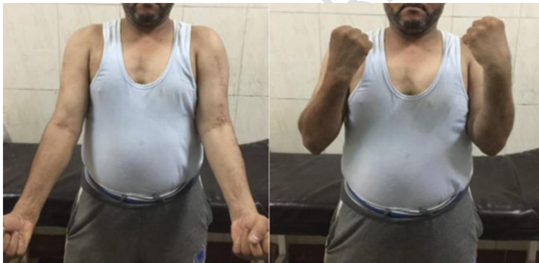
Fig. 3. The post-operative functional outcomes.

Healing time was found to have a statistically significant effect on the end results with the highest incidence of satisfactory results was found in patients with healing time less than 14 weeks (P = 0.025). Table (4)