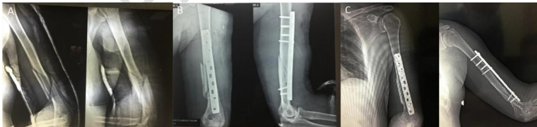
Fig. 2. A) X-ray of a patient with humeral shaft fractures preoperatively. B) X-ray of a patient with humeral shaft fractures postoperatively. C) X-ray films showed fractures united four months postoperatively.

According to Q-DASH score for the studied cases, eighteen cases had satisfactory results. On the other hand, three patients had unsatisfactory results. Table (3). And according to elbow ROM, flexion