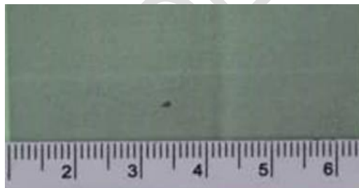
Fig.3 showing the removed metallic foreign body from the anterior chamber of the left eye.

Three days after the treatment, surgical removal of the mass was planned. Under subtenon's xylocaine 2% anaesthesia, a corneal incision was made on the inner side of limbus from 3 - 4.30 clock position. Viscoelastic was injected into anterior chamber and the soft fibrin mass on the surface of iris was separated. It was removed using Kelman's forceps. The viscoelastic was washed and anterior chamber was formed with saline. The corneal wound was closed with 10-0 nylon suture. Sub conjunctival injection of gentamicin 20 mg and dexamethasone 2 mg was given before patching the left eye. On opening the yellow mass, a small metallic foreign body (2 x 1 mm) was detected wrapped within the fibrin material (Fig. 3).