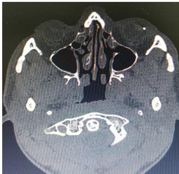
Fig. 2 Axial CT scan of orbits showing the hyper dense area (foreign body) in the anterior chamber of the left eye.

This atypical appearance of a mass in the anterior chamber, in combination with no intraocular foreign body seen on X-ray, proved to be diagnostically challenging. A CT scan of orbits was subsequently performed, which showed a small hyper dense radio-opaque area in the left anterior chamber (Fig. 2) suggestive of foreign body. The globe appeared intact. A final diagnosis of a metallic foreign body in the left anterior chamber was made.