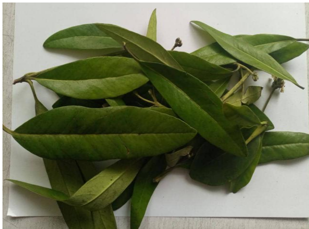
Image 5 Acrostichum aureum