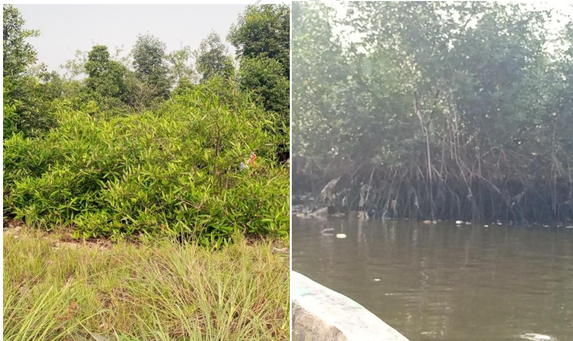
Image 1: Acrostichum aureum (golden leather fern) Image 2: Rhizophora mangle (Red mangrove)

The roots of mangrove plants used in this study were collected from Creek Road water front (Bonny Jetty) Old Port Harcourt Township, Rivers State, Nigeria. The area has lots of mangrove species and also was an area that witnesses lots of pollution from wastes and activities from speedboats transporting passengers, carpenters building boats, boats transporting wood, diesel, fuel and even crude oil from illegal oil refineries as their products are sometimes discharged, dumped or even burnt in the river. The location is situated at Longitude 4^{\circ} 45' 10.13976'' N and Latitude 7^{\circ} 14' 13.012'' E.