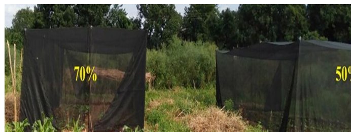
Figure 2: Black shade nets, 70% and 50% growing.