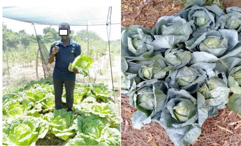
Figure 4: Brassica rapa and Brassica oleracea harvested from 50% shading field at Pwani University farm.

During the second trial, only the cabbage crop grown under shade nets survived. However, there were no significant differences on the number of cabbage heads due to use of 50% and 70% shading. The use of 70% shading on Brassica rapa recorded an insignificant 10% and 15% more cabbage heads than in 50% shading during the first and second trials, respectively.