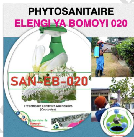
Figure 2. Phytosaneb-020

Plant derivatives can be used as an alternative approach to chemical pesticides [11-12].