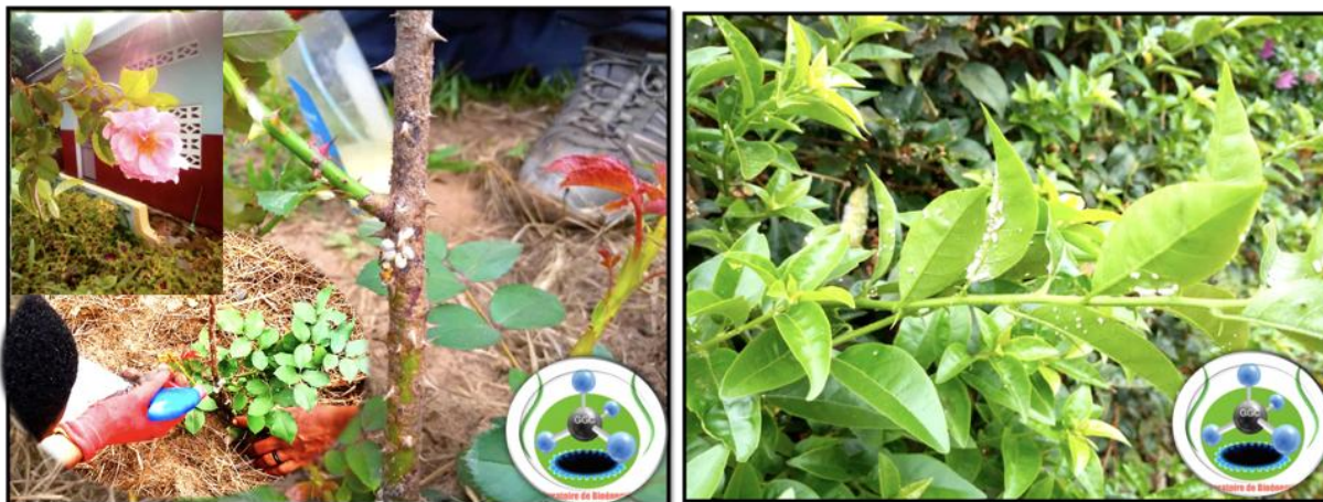
Figure 1. The species Rosa multiflora ( Rosa polyantha ) and Bougainvillea spectabilis attacked by Planococcus ficus (Signoret)

then spreads to whole field. This pest has two common names (pink mealybug and hibiscus mealybug). Among mealybug species, Planococcus ficus (Signoret) is considered key pest of Rosa multiflora ( Rosa polyantha ) and Bougainvillea spectabilis causing serious damages on these ornamental plants[3].