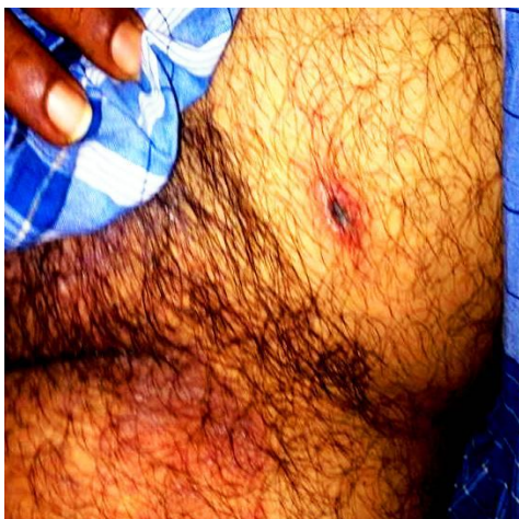
Figure 3. Eschar in the neck