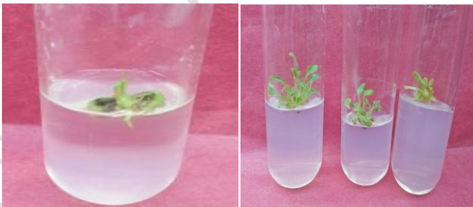
Figure-4 Combination treatment of BAP and Kinetin on in vitro establishment of shoot under CHU media.