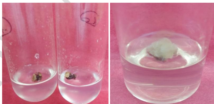
Figure 2 -Callus induction in Gerbera using leaf explants on full strength CHU media.

T 2 -2,4-D @ 2.00 mg l -1 + Kinetin @ 1.50 mg l -1 , T 4 -2,4-D @ 2.00 mg l -1 + Kinetin @ 2.50 mg l -1 , T 6 -2,4-D @ 2.00 mg l -1 + BAP @ 1.50 mg l -1 , T 8 -2,4-D @ 2.00 mg l -1 + BAP @ 2.50 mg l -1