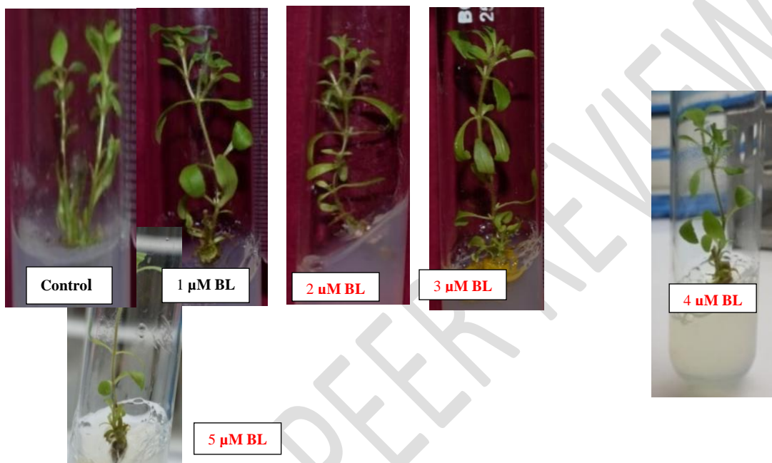
Fig. 2. Effect of different concentrations of brassinolide (BL) on stevia

where, BL =Brassinolide Data are in the form of mean± SEM, and means followed by the same letters within the columns are not significantly different at P \leq 0.05 using Duncan's multiple range test.