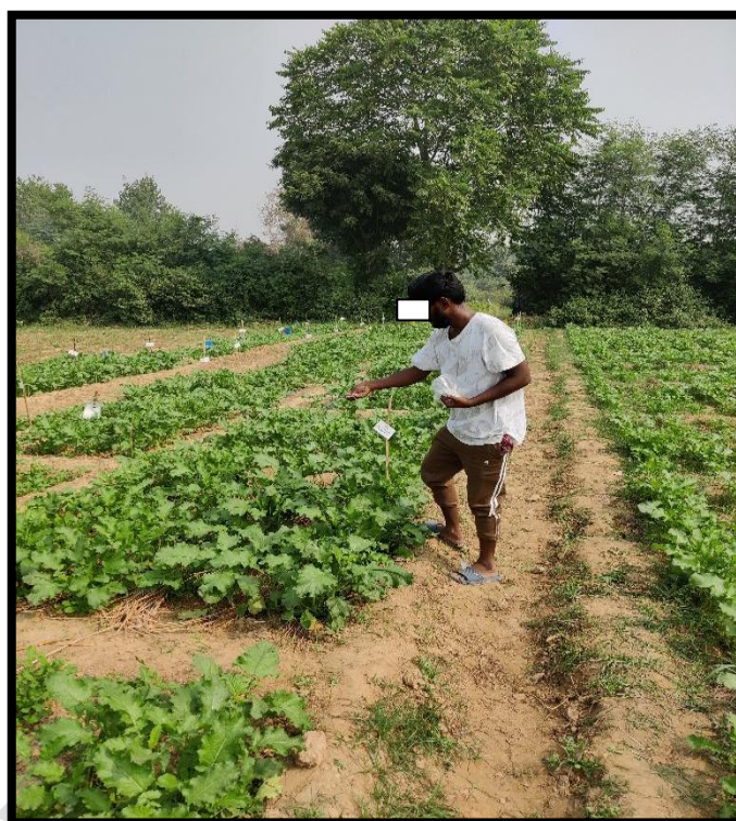
Image 4 : The Recommended Dose of Fertilizer (80:40:40 NPK kg/ha) will be applied, as Half dose of Nitrogen along with full dose of Phosphorus, Potassium and Sulphur as basal and remaining half dose of Nitrogen after 30 Days of Sowing (DAS).