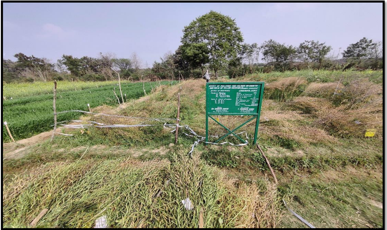
Image 5 : Harvesting in Experimental field at Crop Research Farm during Rabi season, 2021-22