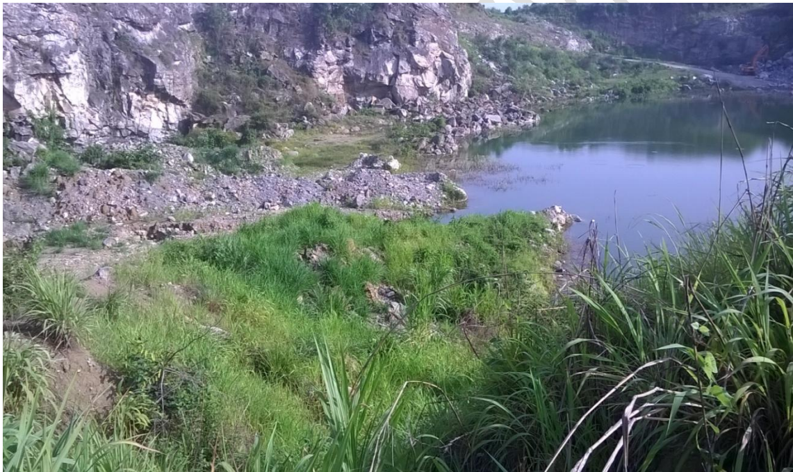
Fig I. Chrush rock Quarry mining site Ishiagu (Site of soil sample collection)

This study was carried out with quarry mining contaminated soil samples from Ishiagu in Ivo local Government Area of Ebonyi State while the cow dung was collected from Lokpa cattle market in Umunochi L.G.A Abia State. The rural settlers in Ishiagu are mainly peasant farmers with most farm products as cassava, vegetables, yam, cocoyam and rice. Quarry sites of leads and zinc are the major industrial activities in Ishiagu. These ever increasing quarry, lead and Zinc industries dispose their wastes into nearby farm lands and these farms are cultivated by the rural settlers.