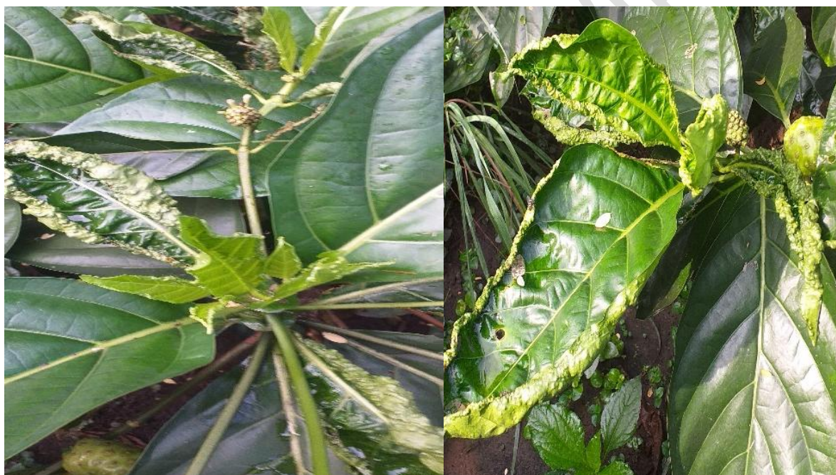
Plate 1. Foliar phytoplasma disease of Noni. Infected shoot are shorter with reduced leaves shrinking upward and inward.

Typical features of the affected shoot in the field with FPD are stunted growth, reduced leaf size with puckers (upward and inward) and lamina shrinkages from petiole to the tip ( Plate 1 ). Such samples were collected from Dilomat farm and conveyed to the Department of Microbiology, Rivers State University, Port Harcourt for analyses.