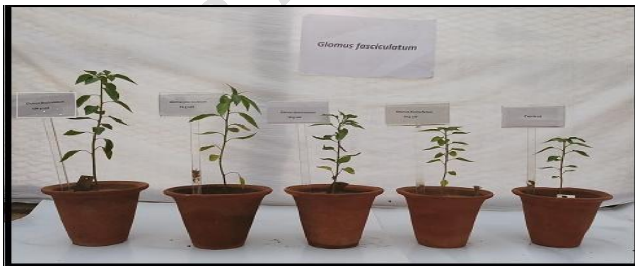
Fig:2 Effect of different doses of mycorrhiza on plant height

The present study was done with the objective of best dose of mycorrhization in Capsicum annum plants. A pot experiment was conducted in screen house of Plant Pathology, CCS HAU, Hisar, to see the effect of Glomus fasciculatum with different doses. Mycorrhizal colonization in roots and number of sporocarps in soil was calculated at 30, 45, 60 and 90 days after transplanting. Plant height, root length, dry weight of root and shoot and SPAD chlorophyll content at 30, 45, 60 and 90 days after transplanting were recorded. Nutrient content (NPK) at 90 days after transplanting was calculated.