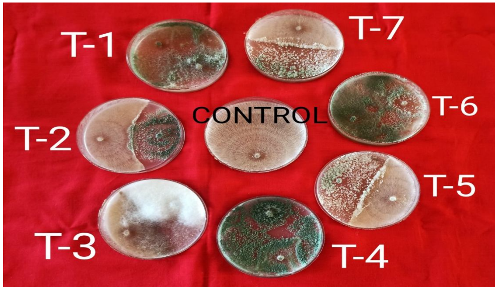
Plate 1: In vitro evaluation of bio control agents against growth of R.solani