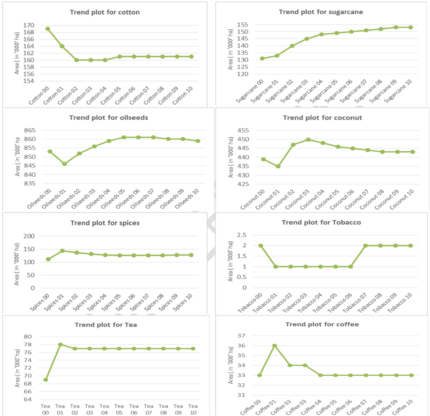
Fig 2. Forecasted area for cash crops in Tamil Nadu by simulating TPM for Period-VI (2021-2030)