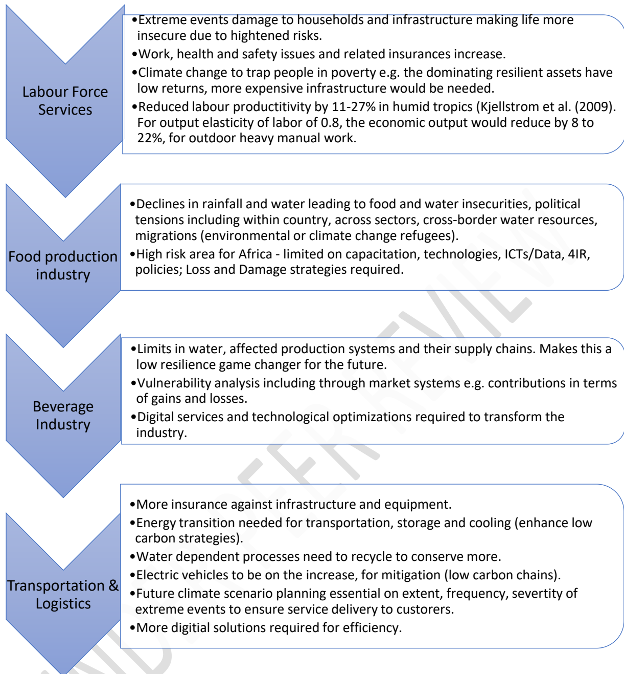
Figure 3. Futuristic outlook of specific services/industries vulnerability to climate change