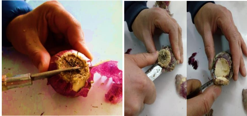
Image 1 Scoring

Coca peat was used as source of media and bulbs after scooping were placed on this media with scooped portion facing upwards. Moisture of the media was ensured to keep bulbs viable and were kept at 20-25°C temperature under dark conditions for 3 months.