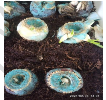
Pics: Experimental view