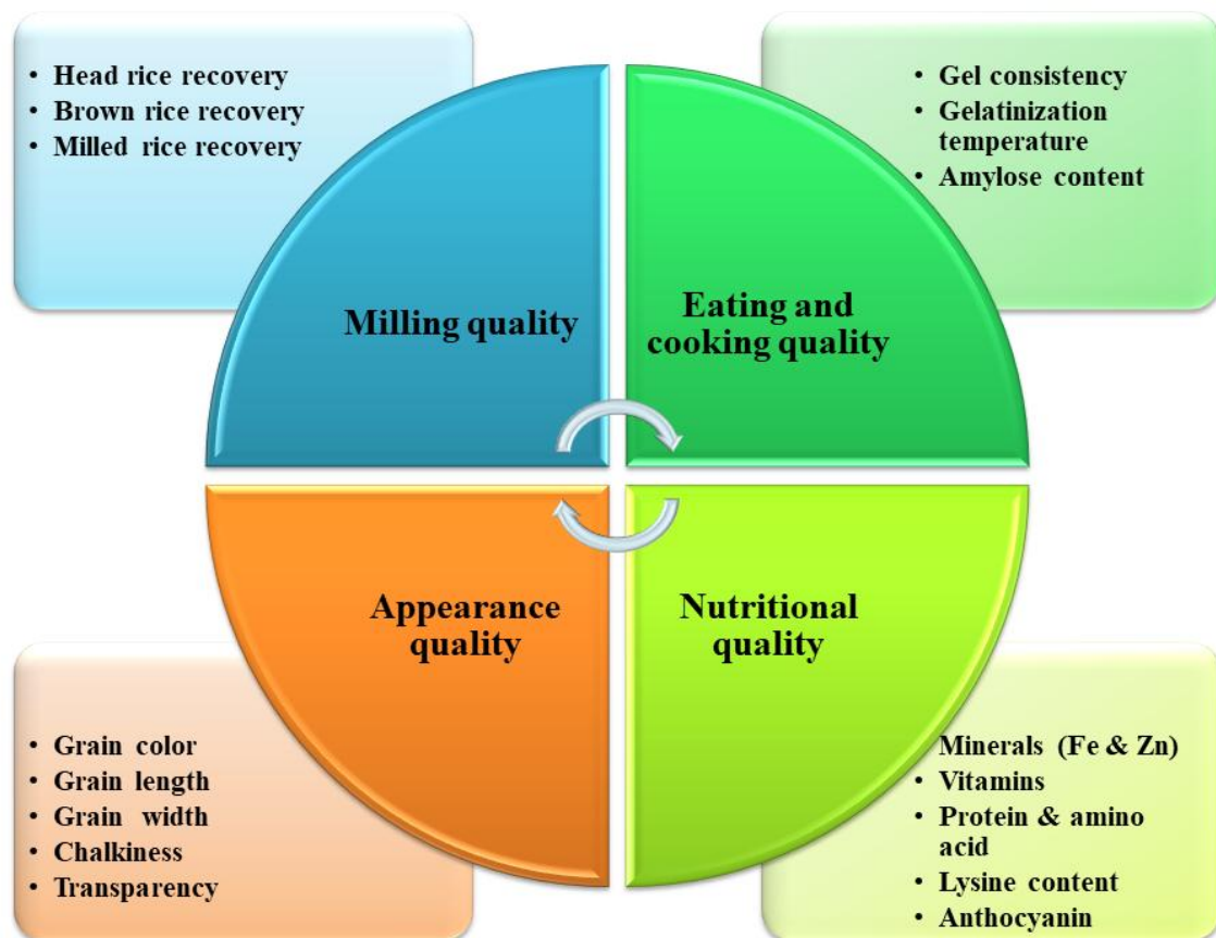
Figure-2: Four facets of grain quality traits in rice