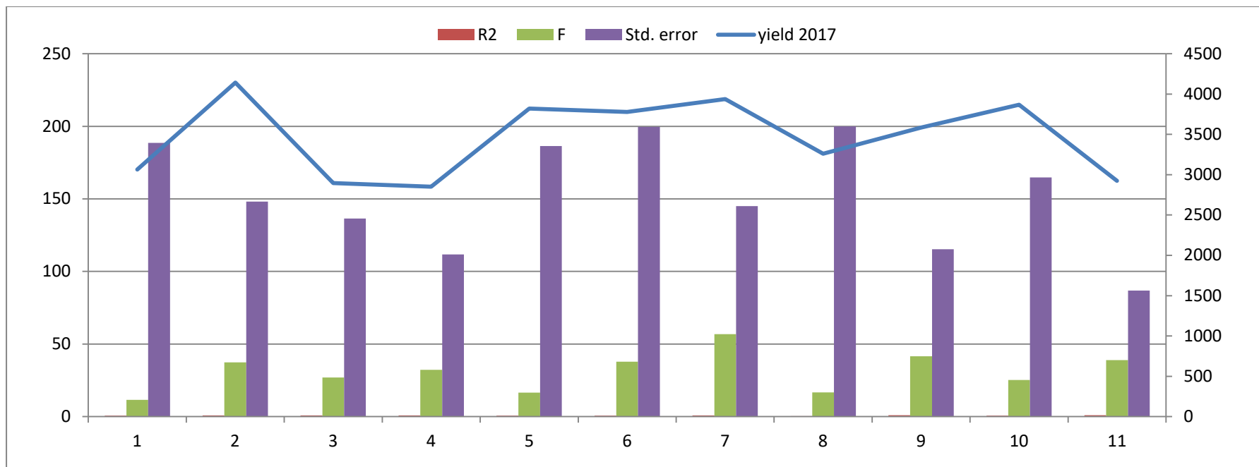
Fig-1:-Pre-harvest yield forecasting statistical model (f3 stage) of wheat crop for different districts of Western Uttar Pradesh