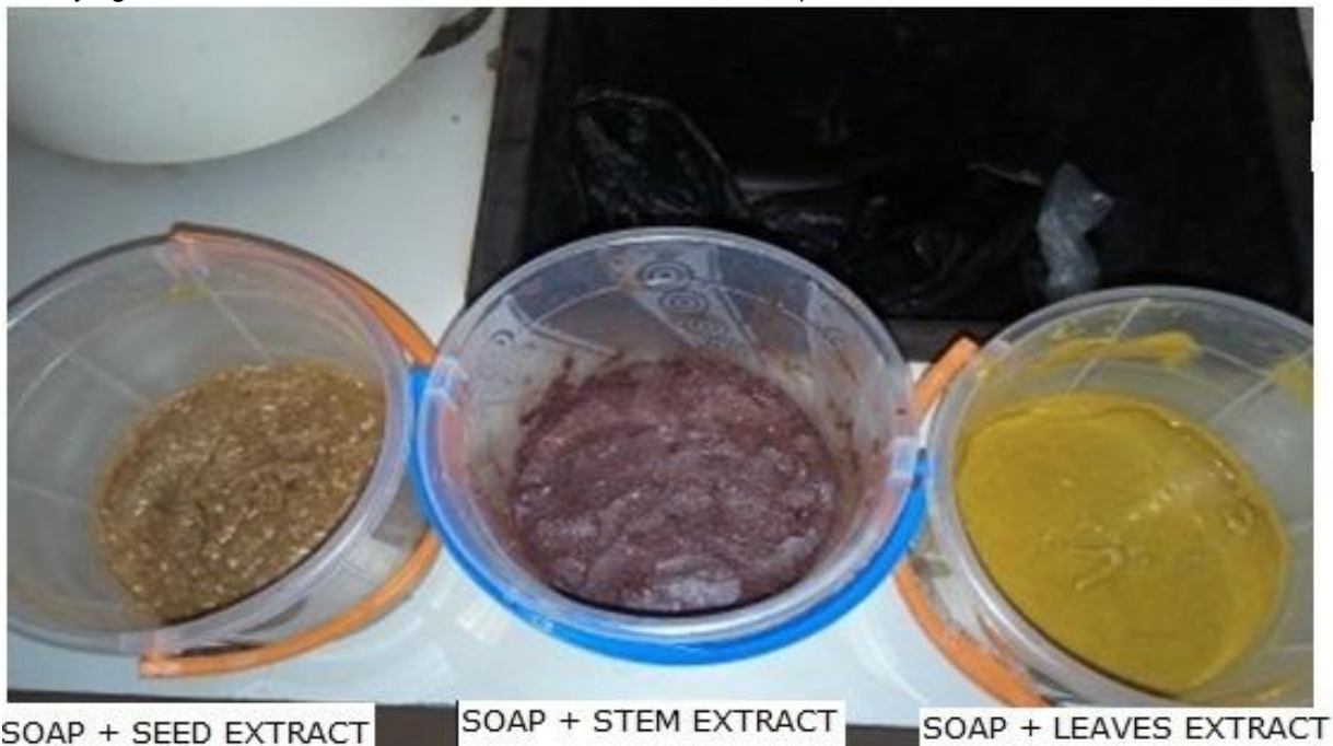
Fig. 3. Production of Seed, Stem and Leaves Extracts Soaps

from the Neem stem and seeds (NSTM and NSED) using equal quantities by volume of the active ingredients from leaves, seeds and stems., equivalent to 15g for the bark (sample NSTM) and 10g for the crushed seed (sample NSED).