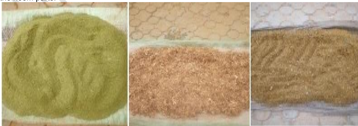
Fig. 1. Grinded Neem Extracts of Leaves; Stem and Seeds.

Fresh leaves, seeds and barks were collected of one of the tree from the Neem colony in Kalgo town at the outskirts of Birnin Kebbi, Kebbi State Nigeria in considerable quantity and open air dried for a period of two weeks under shed to avoid decolonization and depletion of nutrients 7 . They were then grinded in mortar and sieved to fine powdered particles as seen in figure 1 below.