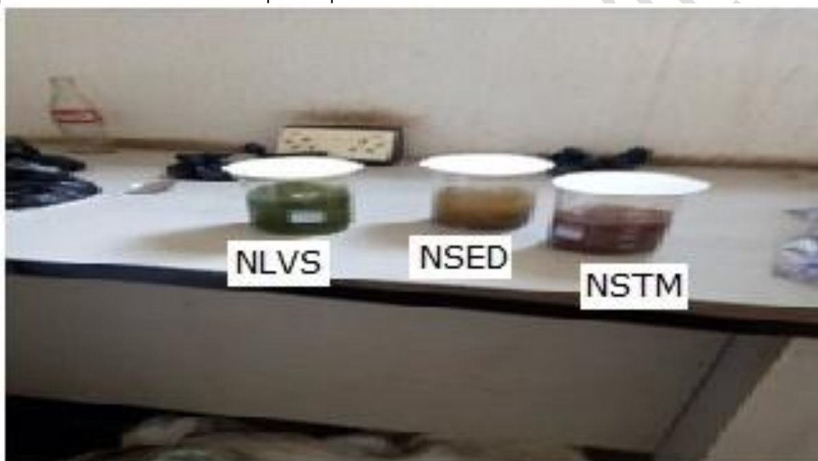
Fig. 2, Pre-fermentation of Neem Samples

The fermentation process was carried by measuring 70g of each powdered extracts (seed, stem and leaves) and transferring them into three separate 1000ml beakers. The beakers were labelled as NLVS (leaves) NSED (seeds) and NSTM (stem) respectively. 600ml of distilled water was added to each extract in the beaker and allowed to stand for 48 hours for fermentation to take place. After 48 hours the solutions were then filtered using vacuum filtration machine to obtain clear fermented solutions.