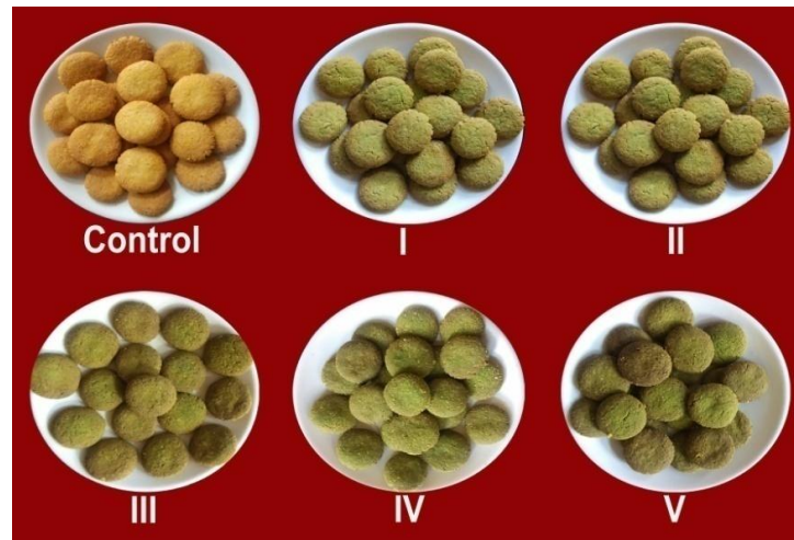
Fig 1: Nutritional evaluation

Five combinations were used for preparation of biscuits. The standard recipe of biscuits was taken as control. Biscuits were organoleptically evaluated by a panel of semi trained judges using 9 point hedonic scale. It was observed that biscuits were found acceptable up to 10 per cent level of incorporation of spinach leaves powder. The acceptable biscuits were selected for further nutritional analysis. These spinach and chickpea incorporated biscuits were oven dried at 60°C and ground to fine powder and stored in air tight container for nutritional evaluation.