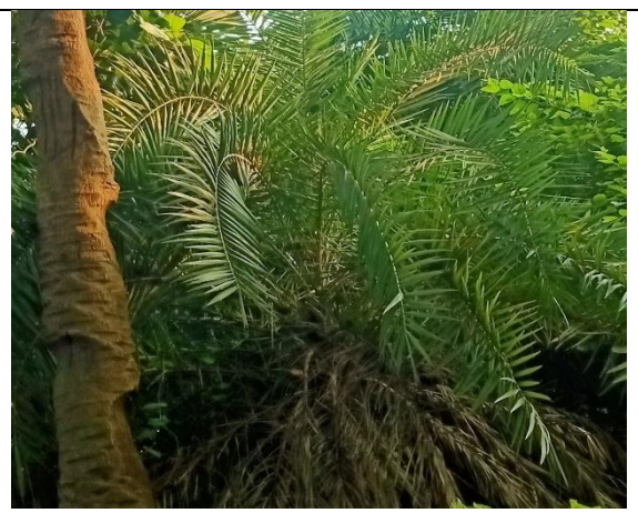
Image2 Date palm ( Phoenix dactylofora )