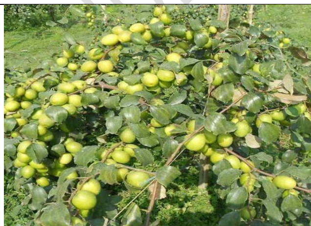
Image1: Bair or Badar leaves ( Ziziphus mauritiana )

200-500gms doodle or asthma plant ( Euphorbia hirta ) commonly called as ‘Doodhkijadi’ was fed to animal once a day to cure diarrhoea or, dysentery.