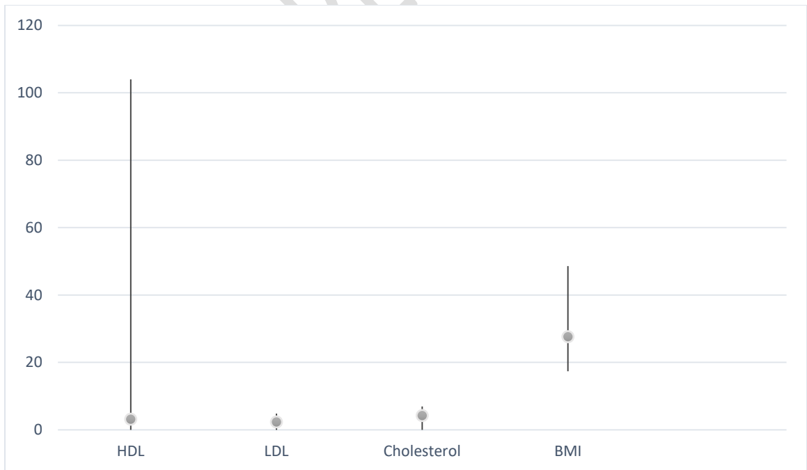
Figure 3: Mean and distribution of Lipid Profile (2021-2022)