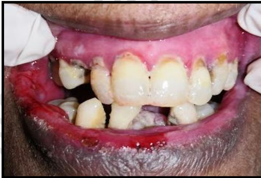
Figure 1: Dried and bleeding lips

Figure 5: Orthopantomogram revealing a diffuse, poorly defined radiolucency with ragged borders in relation to 34–43, extending laterally on either side and involving the surrounding alveolar bone.