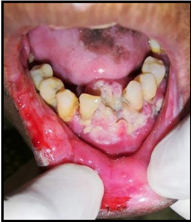
Figure 2: Ulceroproliferative growth, extending from the mesial aspect of 43 to the mesial aspect of 34 and labio-lingually from the labial vestibule to lingual vestibule corresponding to 33 – 42.