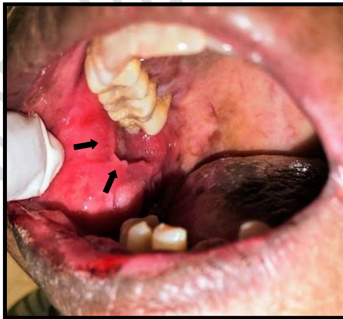
Figure 3: An ulcerative lesion extending along the line of occlusion from the mesial aspect of 26 to the distal aspect of 27 was present on the right buccal mucosa.