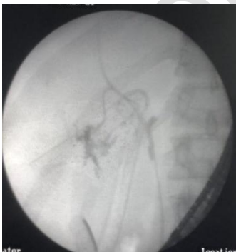
(Fig.1):Leak of contrast in Right posterior sectoral duct