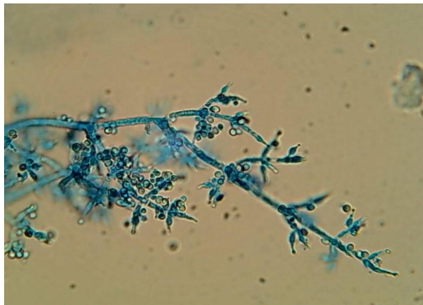
Fig 2: Photomicrograph of Trichoderma harzianum MAG × 400

A drop of Lacto phenol in cotton blue was used to stain the slide. Sterilized inoculation needle was used to pick the spores of the fungi from culture plates and Placed on the slide containing the lacto phenol in cotton blue then covered with cover slide for observation and identification under a light microscope. (Olympus Optical Philippines) with magnification (x40). The morphological structures of the fungi were compared with those in the Atlas of Imperfect Fungi by (Barnett HL., Hunter BB. 1998). for identification.