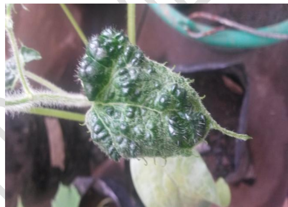
Fig 5b: Severe rugosity and mottling on C. Mannii