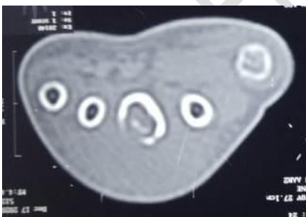
Fig.3 CT Scan showing lytic destructive area 3 rd metacarpal bone, flaring of medullary cavity with destruction