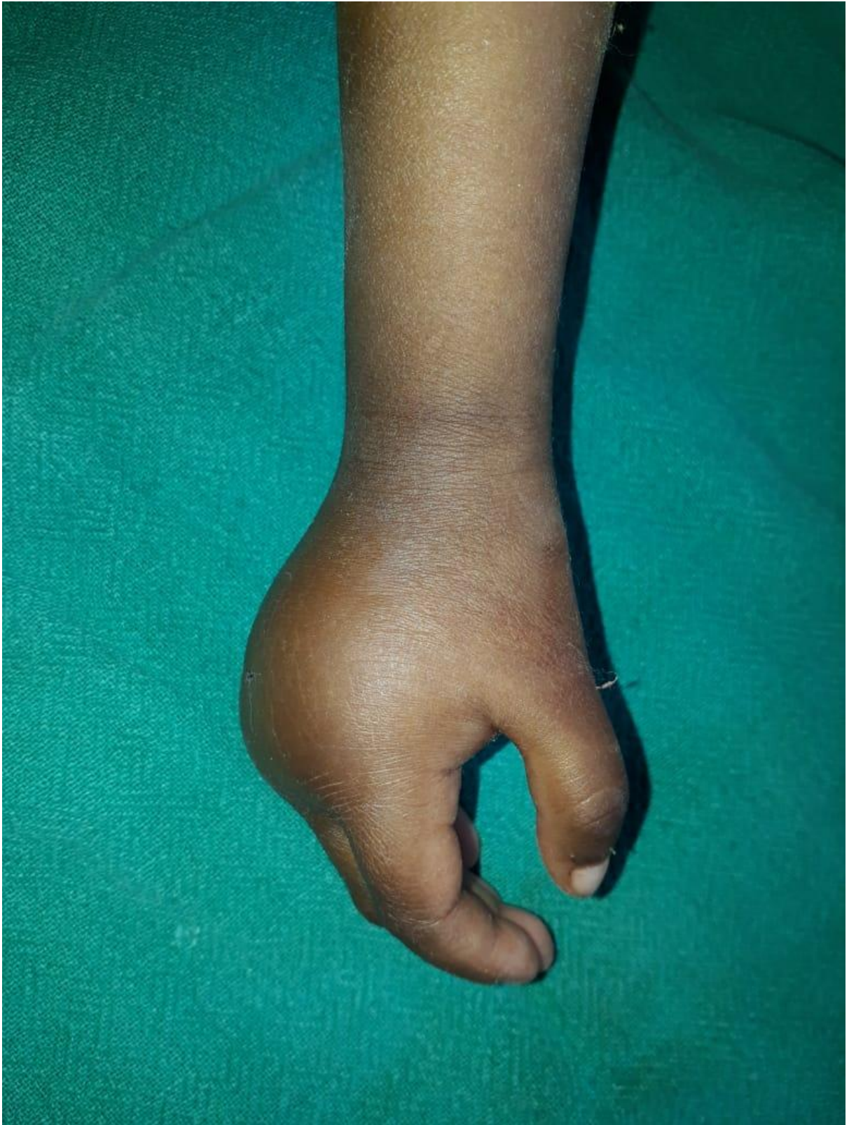
Fig.1 Clinical pic Right Hand at the time of presentation