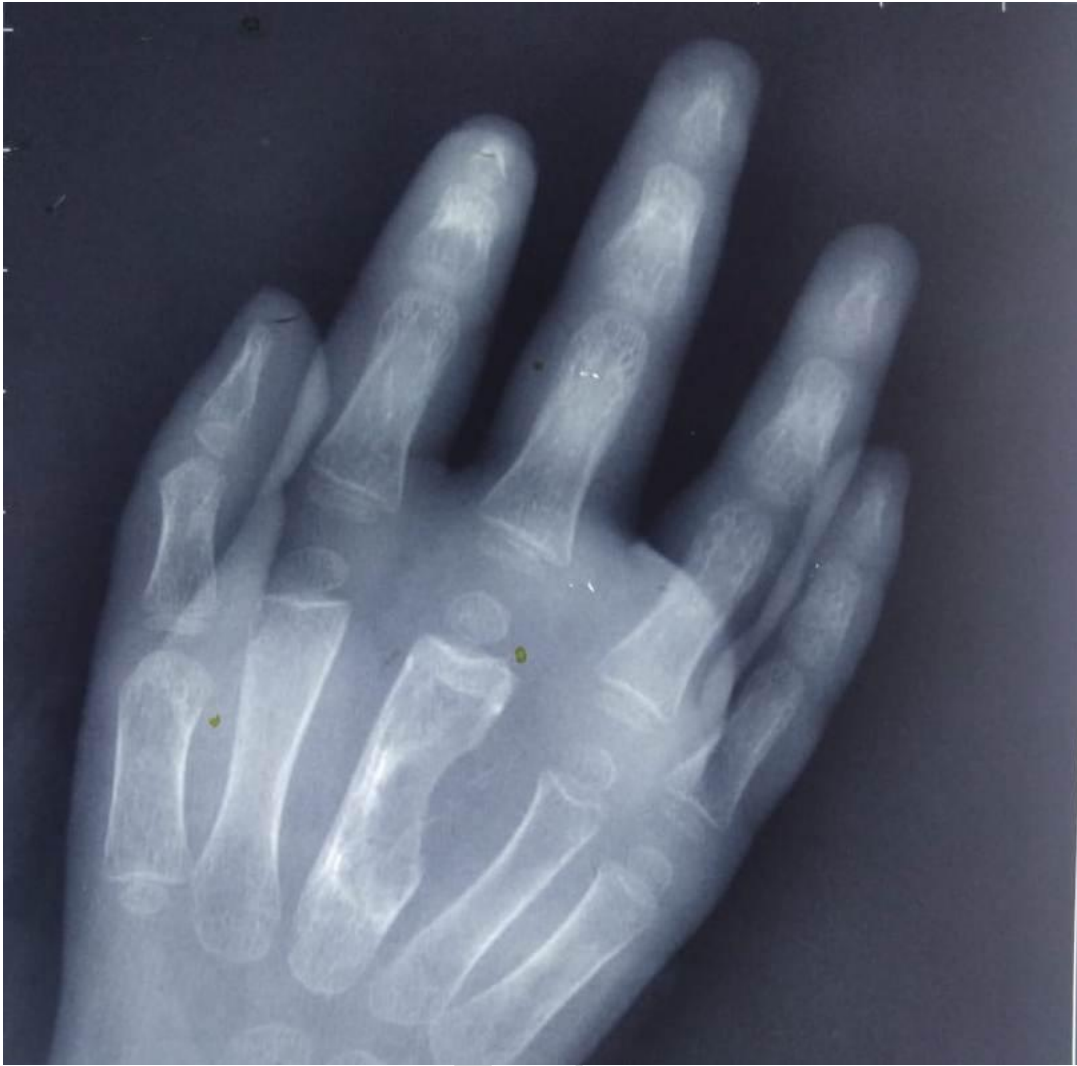
Fig.2 Radiograph showing scalloping of the 3rd meracarpal , subtle cortical irregularities and Osteopenia