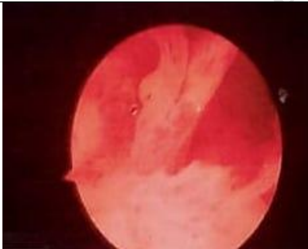
FIGURE 3 SHOWING : HYSTEROSCOPICALLY RETRIEVED INTRAUTERINE FETAL BONES