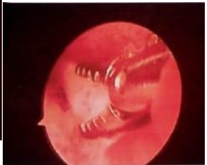
FIGURE 4 SHOWING : HYSTEROSCOPIC IMAGE SHOWING THE WHITISH COLORED BONY STRUCTURE