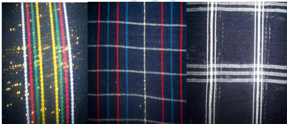
Figure 3. Some modifications made to improve lyapayao handwoven textiles

Improvements in Apayao hand woven textiles came over time. During the time of Honorable Betty C. Verzola ( Mayor-Luna), there were improvements of the abel ( loom weave) Apayao. The influx of additional colors such as violet, white, yellow, green and others were observed. Some abel are also accentuated with silver and gold threads to make the fabrics more appealing.