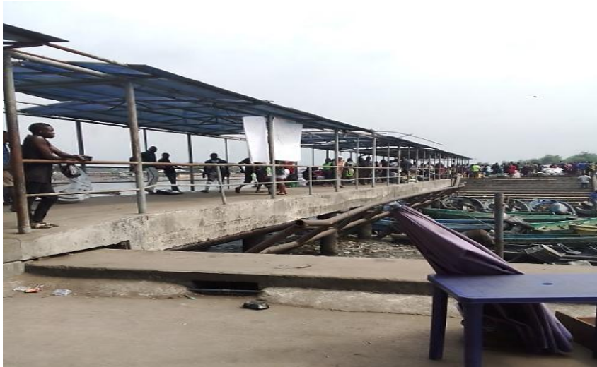
Figure 4: Bille/Bonny/Nembe Jetty, a Newly Improved Water Transport Infrastructure