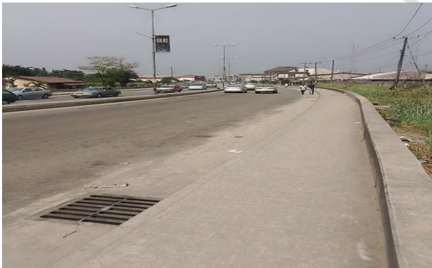
Figure 2: Trans-Amadi Road, an Improved Road Infrastructure