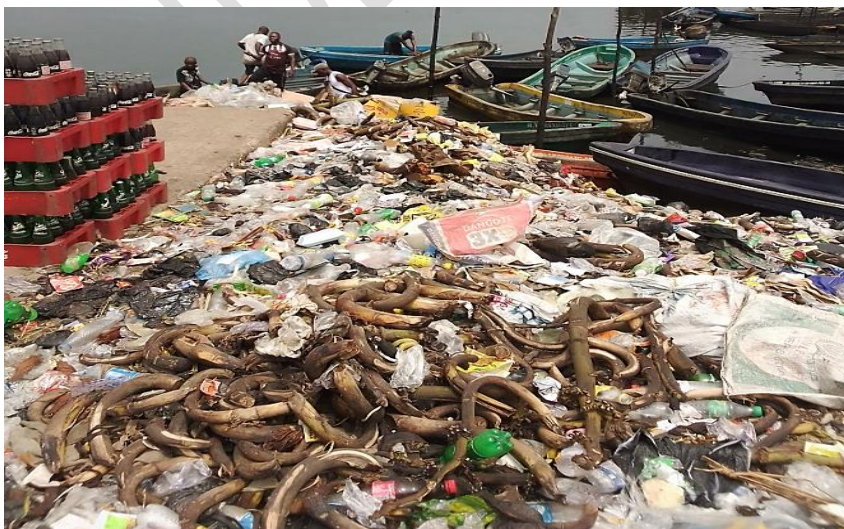
Figure 3: Feltaco Jetty Iwofe, in a Deplorable Condition