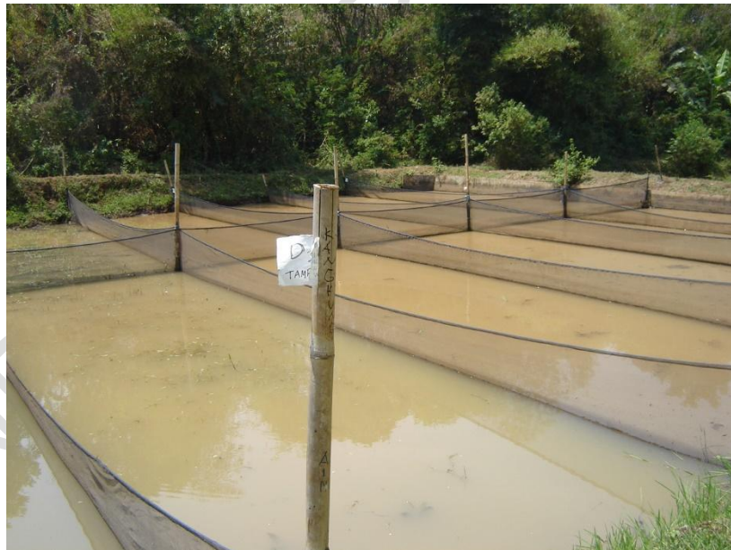
Figure 1. Fish pond cultured

This research was conduct in Ciparanje Pond, Faculty of Fisheries and Marine Sciences, Universitas Padjadjaran and the forage analysis laboratory, Faculty of Animal Science, Padjadjaran University.