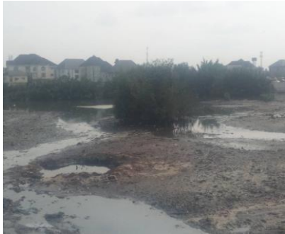
Plate 1: Station 1