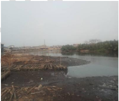
Plate 2: Station 2